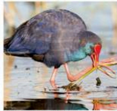
A Gull Faver and a Pup.

visit birdingmajorca.com/birding-maps.htm to buy online or stock the map.