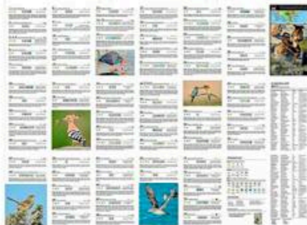
The highly detailed and informative map.

watcher such as the best time of year to visit each place, type of access, the GPS coordinates and the types of habitat and present landscapes. The map also provides information about the most interesting bird species which can be spotted in the area. Finally, the map also has a checklist which includes the 80 most interesting species for the visitor, with the specification of the points where it is easier to observe them.