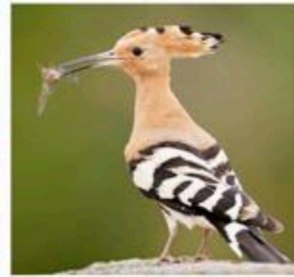
A Gull Faver and a Pup.