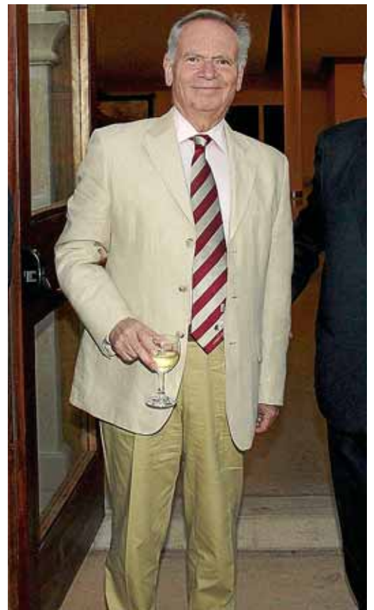
Lord Archer: book signing in Palma.

Be Careful What You Wish For is the fourth novel in Jeffrey Archer's Clifton Chronicles. It was published on 13 March, 2014. The other three books have become international best-sellers.